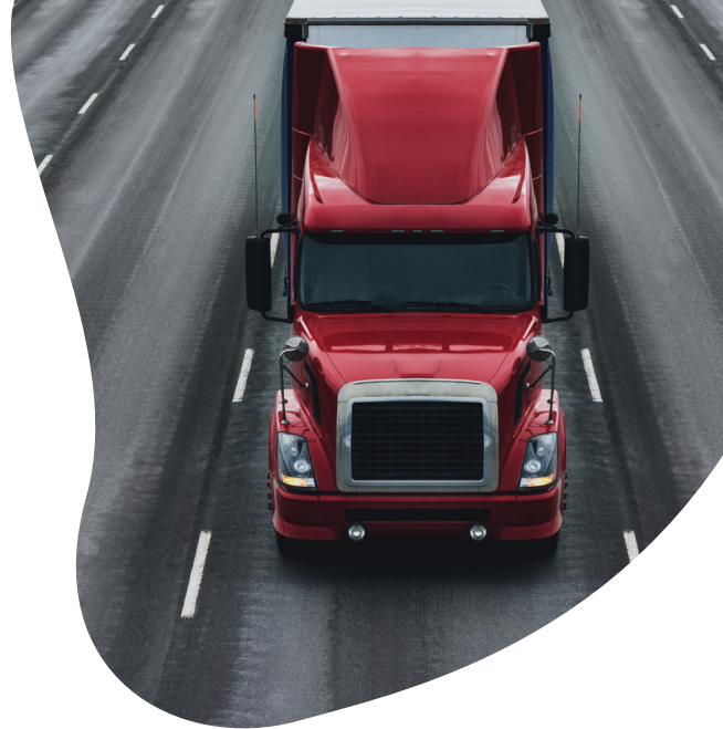
LARGE US DISTRIBUTION COMPANY

minutes saved/invoice no-touch invoices/year